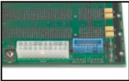
ATX and utility connectors

The Bustronic EasyCable cPCI backplane family is designed with the power insertion area beside the signal slots, allowing for easy and efficient system integration. Adequate numbers of 6/32 nuts and an ATX connector (for the 6U versions) have been inserted in this area to accommodate more power than the 28 amps required per slot. The ATX connector allows for an ATX power supply to be plugged in. The connector has 20 pins standard on our 6U CPCI backplane. The fastons have been added to allow additional power while taking a minimum of space. The blades are rated at 12A each.