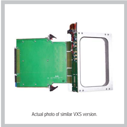
Actual photo of similar VXS version.